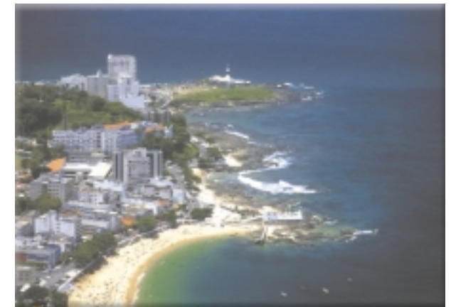
Forte Santo Antonio and Farol da Barra

them are dotted with coconut groves and the ever present thatched-roof beach huts serving seafood, tropical drinks and ice-cold beer.