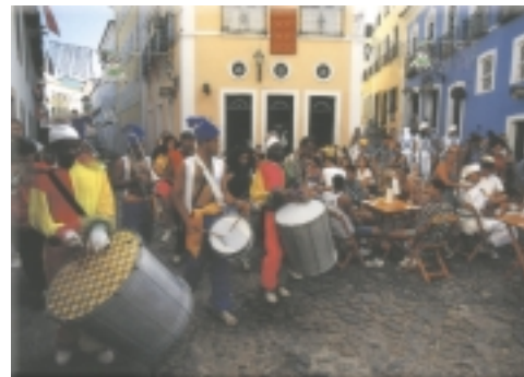
Afro-Brazilian music at Pelourinho

Allegedly there are 365 churches in Salvador.