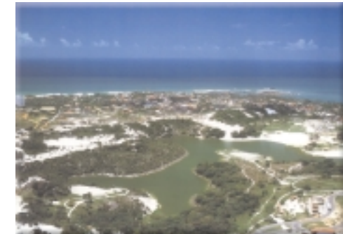
Lagoa de Abaete

Relax at beautiful beaches that cover 40 kilometers (24 miles) of crystal clear sea shore. Many of