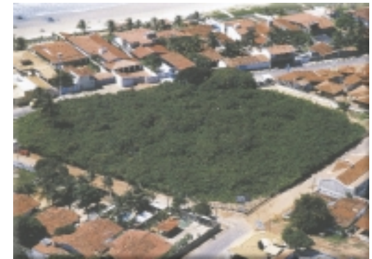
World's largest cashew tree.