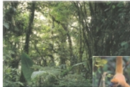
Labyrinth of dense equatorial plants and trees