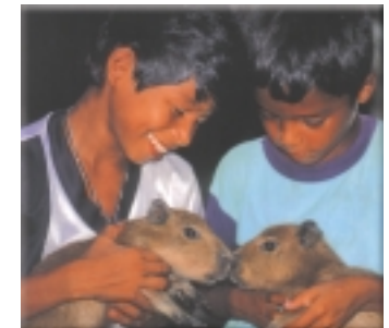
Baby capybaras at Zoo

Your scenic drive takes you through interesting buildings and places including the Customs House, Opera House, Indian Museum and Military Zoo.