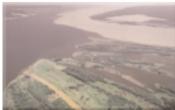
River banks are separated by span of 11 miles (18km)

Take a riverboat to ride up the dark waters of the mysterious Rio Negro. Just a few miles further the mighty Solimões river and the Rio Negro meet, forming the Amazon river.