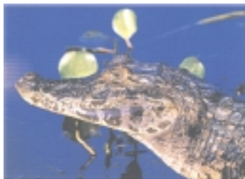
Caiman may weight up to 680 pounds (300kg)

What about catching an alligator at evening armed only with a flashlight and bare hands? Impossible? Take the tour and you will know how.